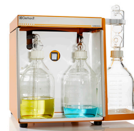
TURBOSOG + ZKE (optional)

Infinitely variable scrubber system for extracting and neutralising aggressive acid fumes