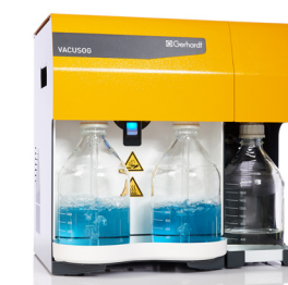
VACUSOG + ZKE (optional)