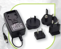
Power Adapter (60X426401)