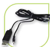
USB Cable (MINIPHONEUSB)