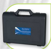
Hard Carry Case (56X259306)