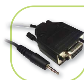
RS232 Cable (30X427301)