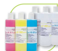
Colored & Colorless Buffer Solutions (ECPHBUFKITC) (ECPHBUFKIT)