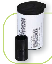
RDO Sensor Cap