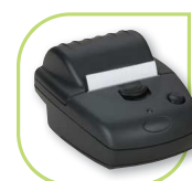
RS232 Thermal Printer (01X594301)