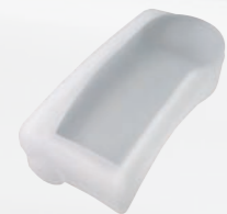
▲ PAL Silicone Cover

◀ Small Volume Sample Adapter for PAL Allows for measurements with a small volume of sample. Place directly on the sample stage.