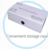
Convenient storage case